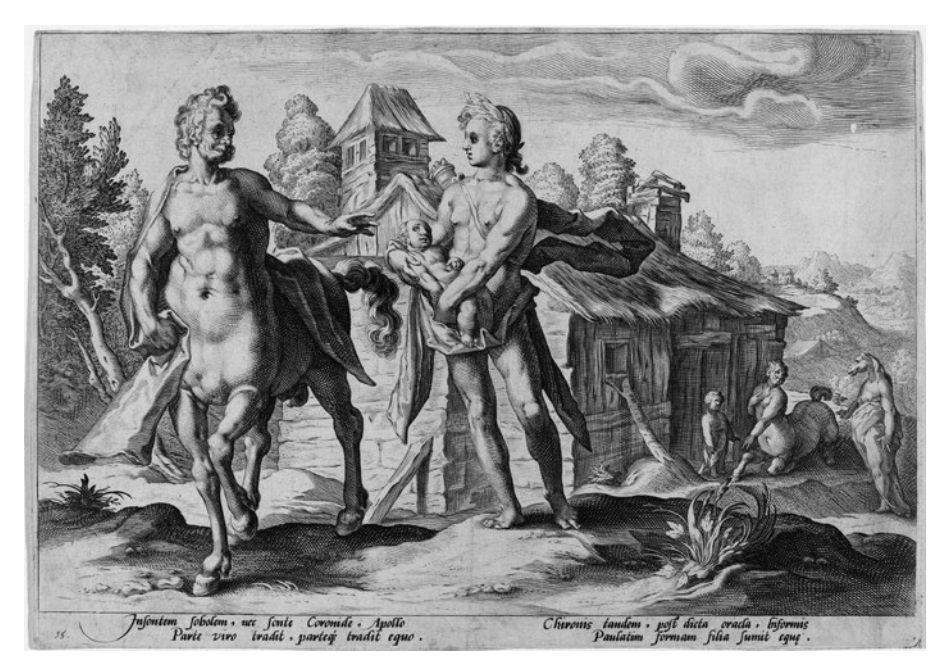
Figure 1: Hendrick Goltzius (1558 – 1617): Apollo, about to entrust centaur Chiron with the education of Asclepius

In the 21st century, medical and biomedical sciences have become a major industry through specialised hospitals, laboratories, universities and commercial enterprises. Education, while for many ages focused on primary schooling and handicraft for the youth, has developed in the past century in industrialised societies with secondary education for most and tertiary education for many citizens with important scientific foundations. The science of education has developed strongly in the 20th century.